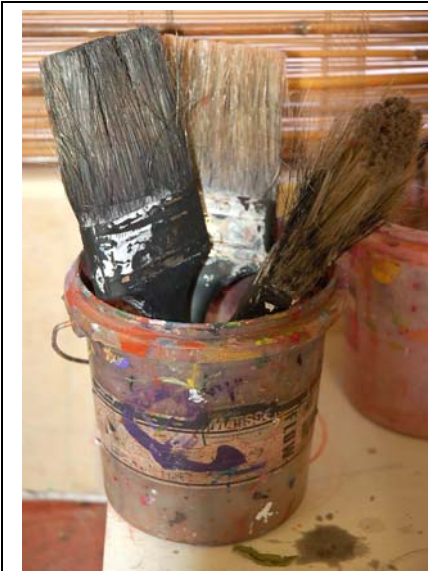
Large Paint Brush