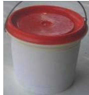
containers with lids that seal properly