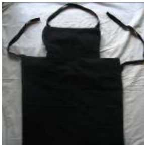
work apron, preferably plastic