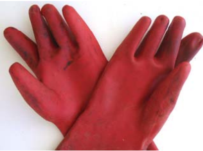
plastic gloves or disposable gloves