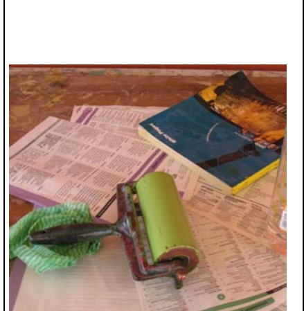
Newspaper or scrap paper