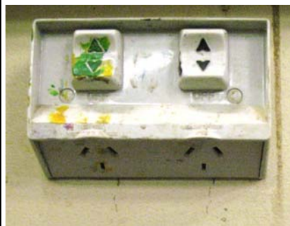
Safe power points