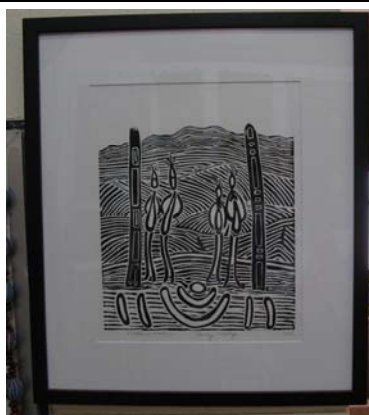
Frame or mount