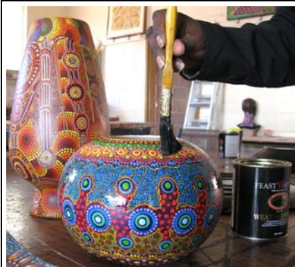
Fixative or Varnish