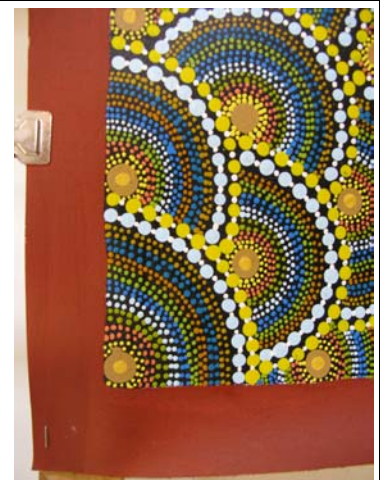
Background paint colours