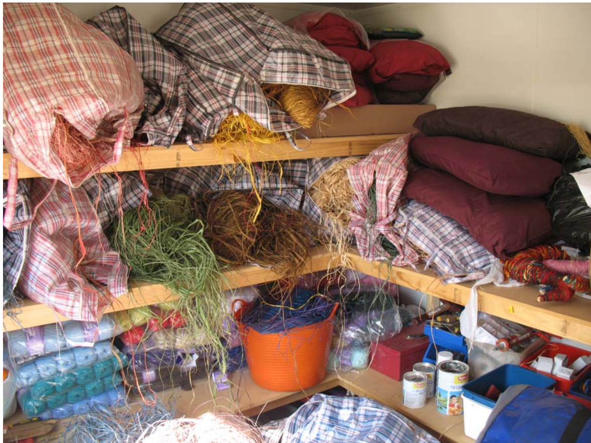
Storage of Bulk Materials.